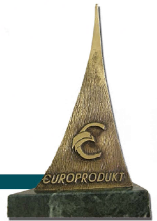
The Europroduct Title