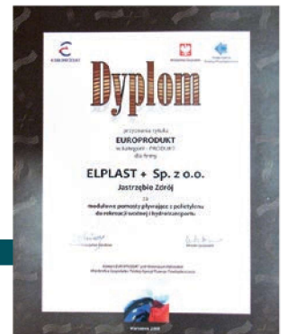
The Europroduct Diploma