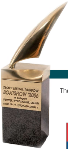
The Boat Show Gold Medal